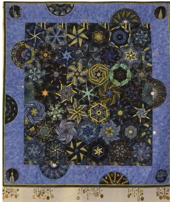
First prize Embellished Quilts Ellen Yamaguchi New York City Lights 47x44