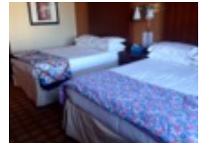
Quilts at the end of the bed to brighten the rooms

Three quilts delivered to the Ronald McDonald House were received with great gratitude. Thank you to all who made blocks. Also special thanks to members who gave extra time to sew blocks together, quilt a quilt, hand sew a binding or donate a batting. Other quilts are currently being assembled or quilted.