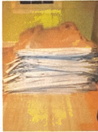
The pile of cut pieces starts to grow...waiting for the next step