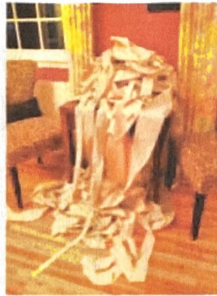
Had to rip it down to 100" and here is the beginning of the pile of scrap