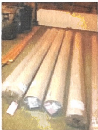
475 yards of 108" muslin – weighing in at 675 pounds -- arrive at Mary Cannizzaro's house