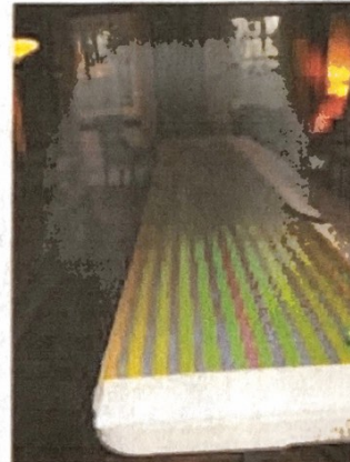
Moved the furniture back in the Living Room and set up two folding tables and an ironing surface of homosote covered with a striped fabric to iron the hem and sides