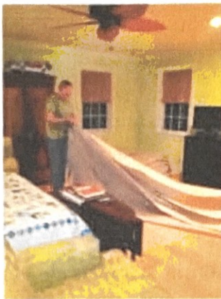
Two people folded the fabric – too long to get both in the picture!