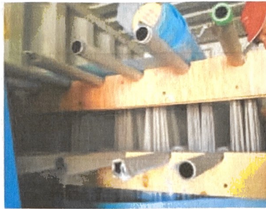
Inside our Storage Shed:

This is the stand that Kay Marcarello's husband, Jim, built for the muslins. They hang perfectly! There are twelve rods with six drapes on each one. The muslins are protected and stored safely until show time.