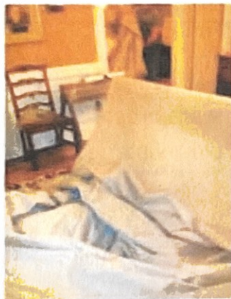
The Dining Room became a cutting station