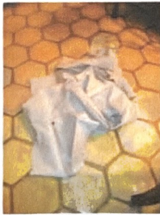
After cutting 475 yards, this was the only scrap!