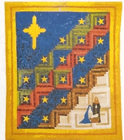
Patti Calautti, Merry Christmas Log Cabin

We are creeping up on that time of year when we once again make our New Year's resolutions. Make sure two of them are to sign up for guild activities and to work on a quilt for our show. It's only 5 months away!