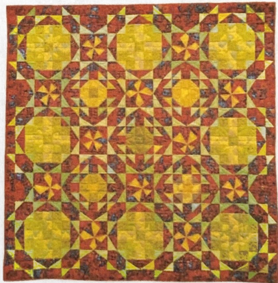
Diana Sharkey, Five Rings