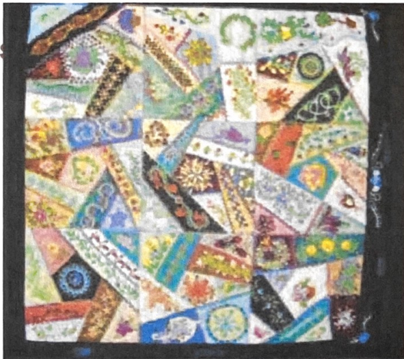
Ellen Purdy, My Petite Victorian Image