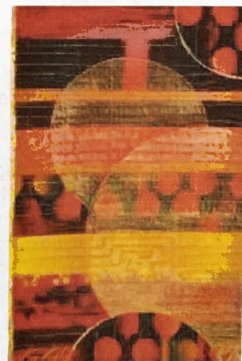
Debbie Bein, Bubbles

Improvisational Piecing + Intuitive Quilting + Paint = Mixed Media Art. Explore the principles of design and pick up Debbie's "intuitive quilting" tips as you complete a work of art to adorn your door, table or narrow wall in your home. Free-motion quilting experience is recommended, but straight-stitch quilting can be used as well. While there is a lot of preparation before coming to this course, the result will be so worth it! Sewing machine with zig-zag capability and $10 materials fee required. Check our website for a detailed course description, supply list, and pre-work instructions. Note: This class is full, but we are taking names for the wait list