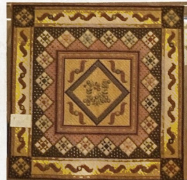
Best of Show Large: Denise Isherwood

As we approach a long-anticipated summer and time-off from meetings, I hope you will sit down to contemplate your Quilt Challenge 2015 contribution. Isn't it fun to have so much time before the deadline? Have a great summer filled with quilting fun!!