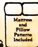
Mattress and Pillow Patterns Included