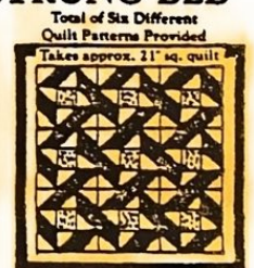
Total of Six Different Quilt Patterns Provided Takes approx. 21' sq. quilt