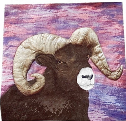
Kendell Storm, Ramshorn 25