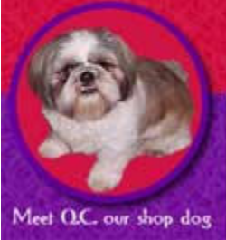
Meet Q.C. our shop dog

312 Danbury Road - New Milford, CT 06776 - 860-355-4516